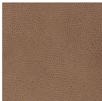
551 Faunal, Brown