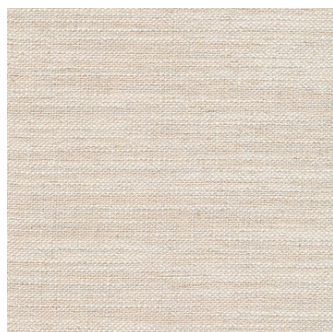
612 Blida, Sand Grey