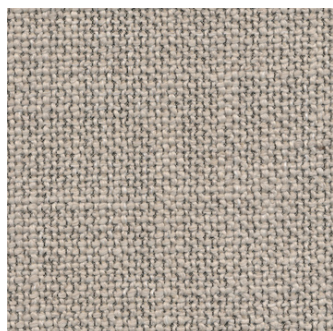
579 Kenya, Gravel