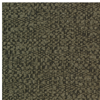
535 Bouclé, Forest Green

Tutti i tessuti sono certificati Oeko-Tex®