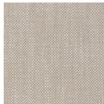
586 Phobos, Latte