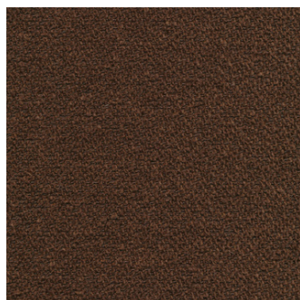
359 Taura, Cappuccino