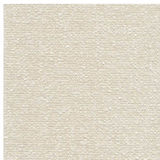
531 Bouclé, Off White