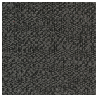
529 Bouclé, Charcoal