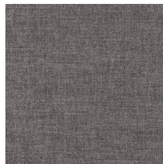
282 Avella, Warm Grey