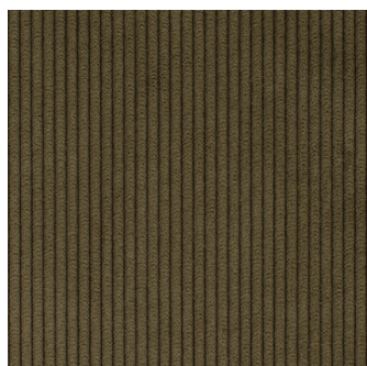
316 Cordufine, Pine Green