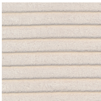
594 Corduroy, Ivory