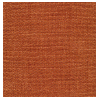
412 Esina, Rust Orange