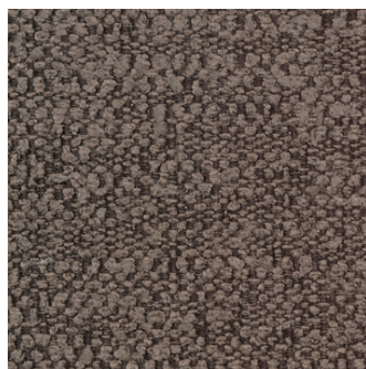
530 Bouclé, Taupe