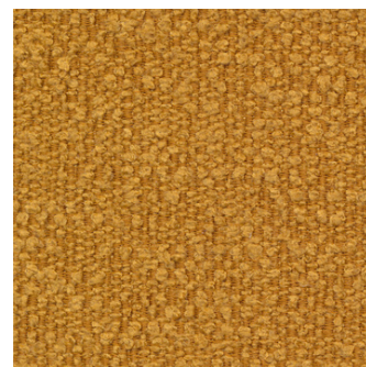
536 Bouclé, Ochre