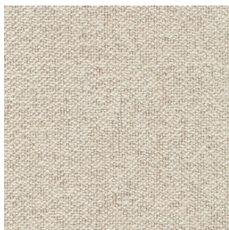
357 Taura, Off White