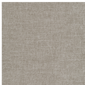
280 Avella, Sand