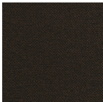
358 Taura, Chocco