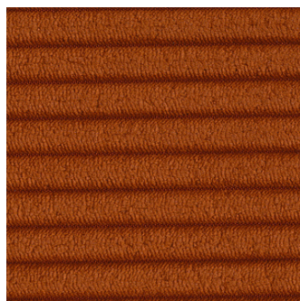
595 Corduroy, Burnt Orange