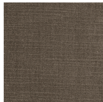
411 Esina, Cedar Brown