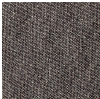
216 Flashtex, Dark Grey