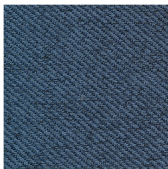
302 Weda, Blue