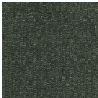
281 Avella, Pine Green