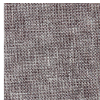
217 Flashtex, Light grey