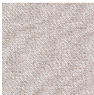
300 Weda, Sand