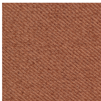
301 Weda, Rust