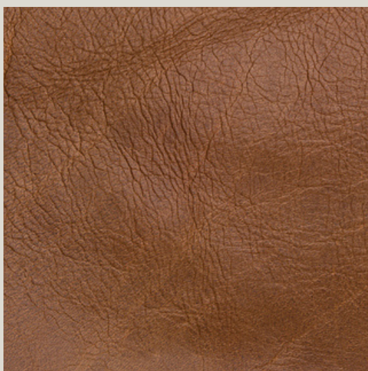
Pelle 2732 Whisky